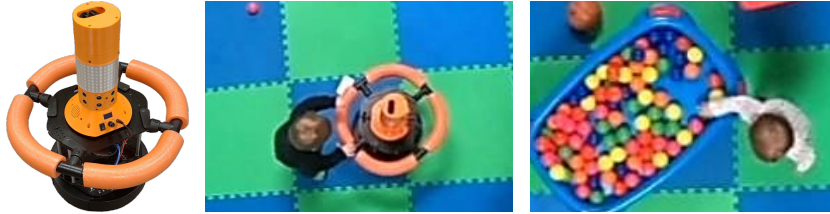
Fig. 1: Child behavior from past studies. Left : Custom assistive robot with light, sound, and bubble stimulus hardware. Center : Robot-interested child interacting with our assistive robot. Right : Robot-uninterested child playing with toys.

addressing models of child-robot interaction, one framework that has been used is ACT-R, which is similar to a programming language for designing models of simulated human cognition [2]. In past work, ACT-R modeled a single child’s actions during hide-and-seek with a robot [23]. Other efforts used Hidden Markov Models to model infant free-play behavior, focusing on toy selection [14]. Our method builds on this past work by combining psychology research on child attention with annotated child-robot interaction video data to construct more realistic models of child behavior. The key research goal of this work was to design and evaluate a beginning set of child behavior models that can help us vet robot interaction strategies for early mobility interventions .