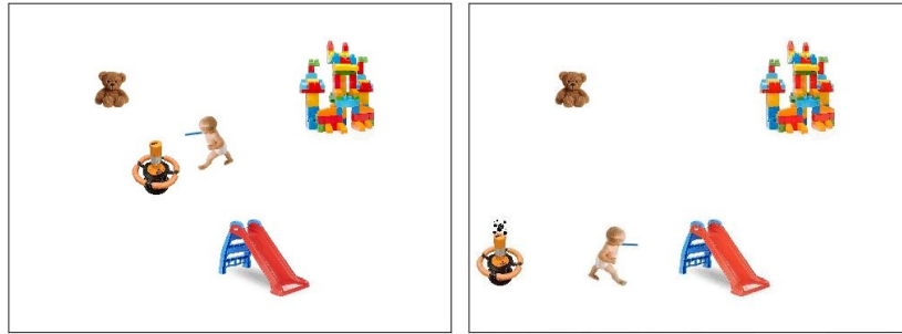
Fig. 2: Left : Stimulus frame depicting the location of the mock infant, toys, and robot. The blue line originating from the child indicates gaze direction. Right : Stimulus frame showing the robot bubbles action. The child image orientation has flipped to match the gaze direction.

to stay near the child to encourage play. The generated video stimuli were 45 seconds on average. Fig. 2 shows two frames from one stimulus video.